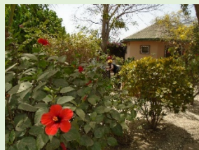
Part of extensive Lodge grounds