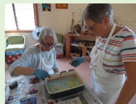
Scenes with guests in the studio